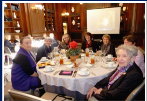
INTERNATIONAL WOMEN'S CLUB OF PHILADELPHIA Fun 25 th Anniversary memories – a Trolley Tour and Lunch at the Meridien