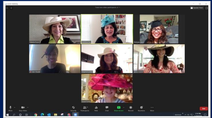
WELCOME TO WASHINGTON INTERNATIONAL CLUB A Defining Moment: WTW successfully shifted to virtual platform by sheer force of will and doggedness! And we did it the WTW way, with a lot of smiles and fancy hats.