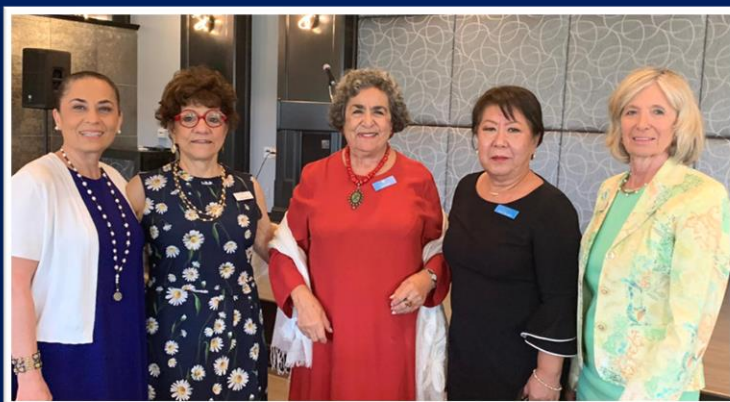
WELCOME TO FLORIDA INTERNATIONAL CLUB Welcome to Florida celebrated its 35 th Anniversary this year!