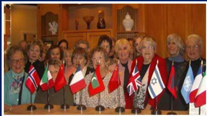
INTERNATIONAL WOMEN'S CLUB OF NEW ENGLAND IWCNE celebrates International Women's Day featuring flags of the many countries our club represents