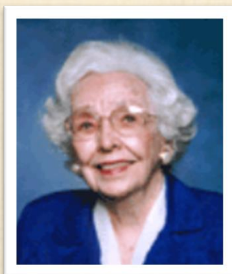
Founder Welcome Clubs International Welcome to Washington Welcome to Florida