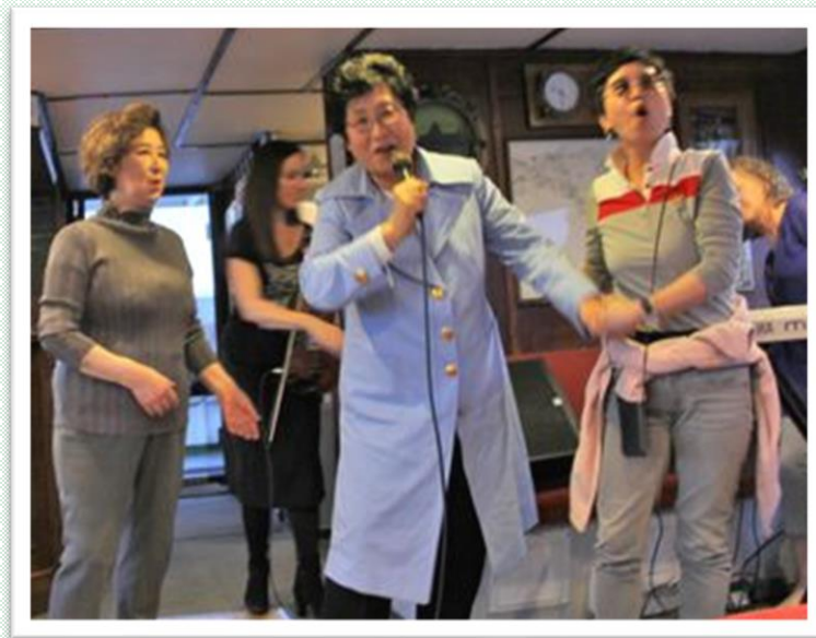
At the fun Dinner Cruise in Galway, Ireland: