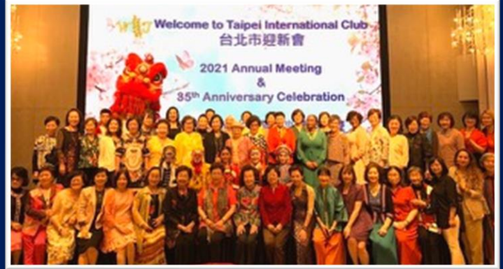
WELCOME TO TAIPEI INTERNATIONAL CLUB WTIC shared a 35 th Anniversary with WCI this year!