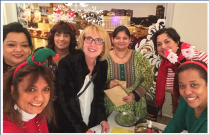
INTERNATIONAL WOMEN'S CLUB OF BAKU We support charities through our Christmas and Novruz Bazaars