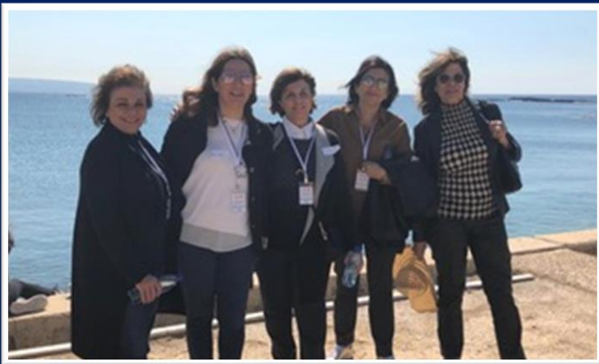
VIA LEBANON INTERNATIONAL CLUB (Vision of International Awareness) In 2020, VIA received its NGO designation in Lebanon

WCI 2012 International Conference Denver, Colorado | USA