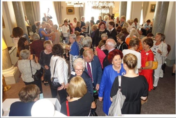
ANGLO-GERMAN INTERNATIONAL WOMEN'S ASSOCIATION AGIWA is 55 years old this year and going strong!