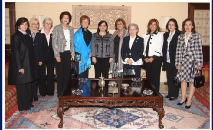
THE WOMEN'S LEAGUE – BEIRUT The Women's League celebrated its 100 th Anniversary in 2020!