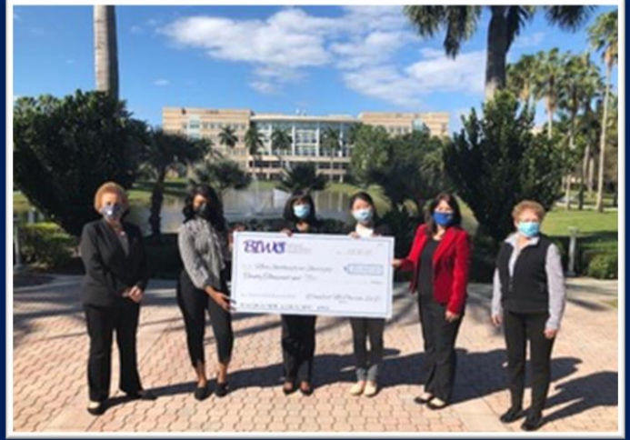
BROWARD INTERNATIONAL WOMEN'S CLUB Our cause: "Changing the World, One Woman at a Time"