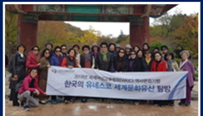
WELCOME TO KOREA INTERNATIONAL CLUB Our motto: Lifelong Education - Cornerstone toward Empowerment