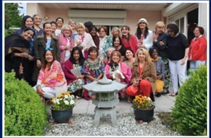
INTERNATIONAL WOMEN'S CLUB OF HAMBURG We are celebrating our 30 th Anniversary this year!