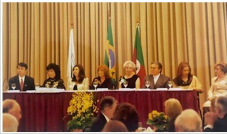
INTERNATIONAL WOMEN'S CLUB – PORTO ALEGRE The 11 th WCI Conference was hosted by IWC Porto Alegre