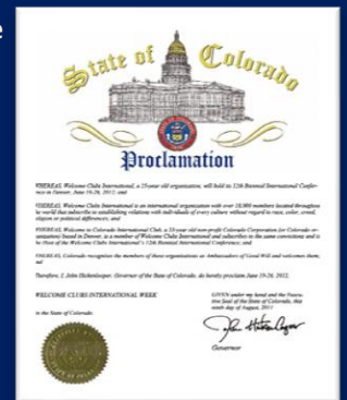
WELCOME TO COLORADO INTERNATIONAL CLUB Welcome to Colorado hosted WCI's 12 th International Conference

Two Hundred and Seventy-Three women from around the world were greeted by the Governor of the State of Colorado with a Proclamation declaring "June 19-26, 2012 Welcome Clubs International Week"