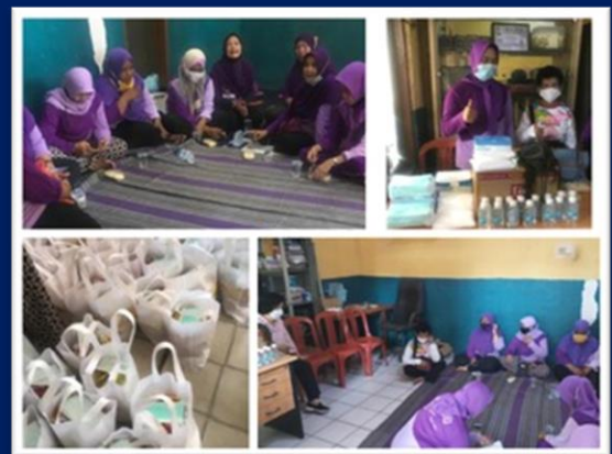
WOMEN'S INTERNATIONAL CLUB – JAKARTA