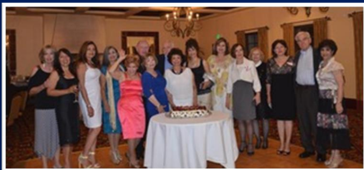
WOMEN'S INTERNATIONAL BORDER CLUB Our 10 th Anniversary celebration