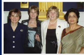
WELCOME TO LONDON INTERNATIONAL WOMEN'S CLUB WL hosted WCI's 1st International Conference in 1990!