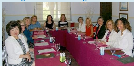
At the 2017 Executive Committee Meeting in Cyprus