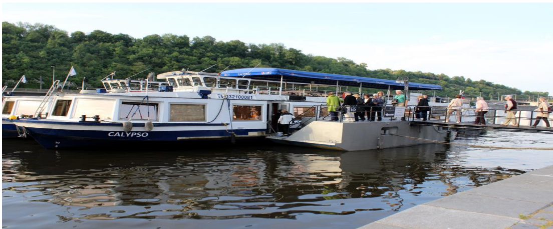
The group enjoyed a private river cruise and dinner

It was a very special week in Prague! WCI thanks Sarka for giving the conference attendees such a wonderful time.