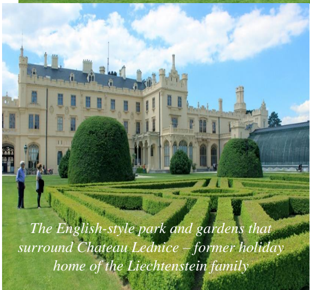
The English-style park and gardens that surround Chateau Lednice – former holiday home of the Liechtenstein family