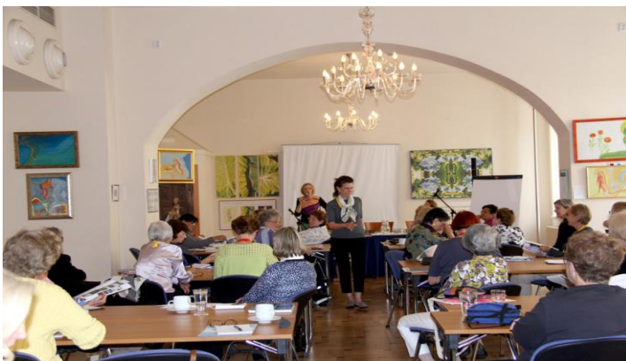
Board of Directors' Meeting