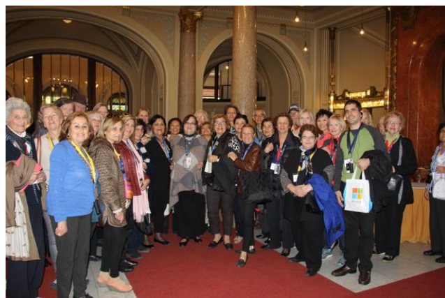
Conference participants on a tour of Prague's Municipal House