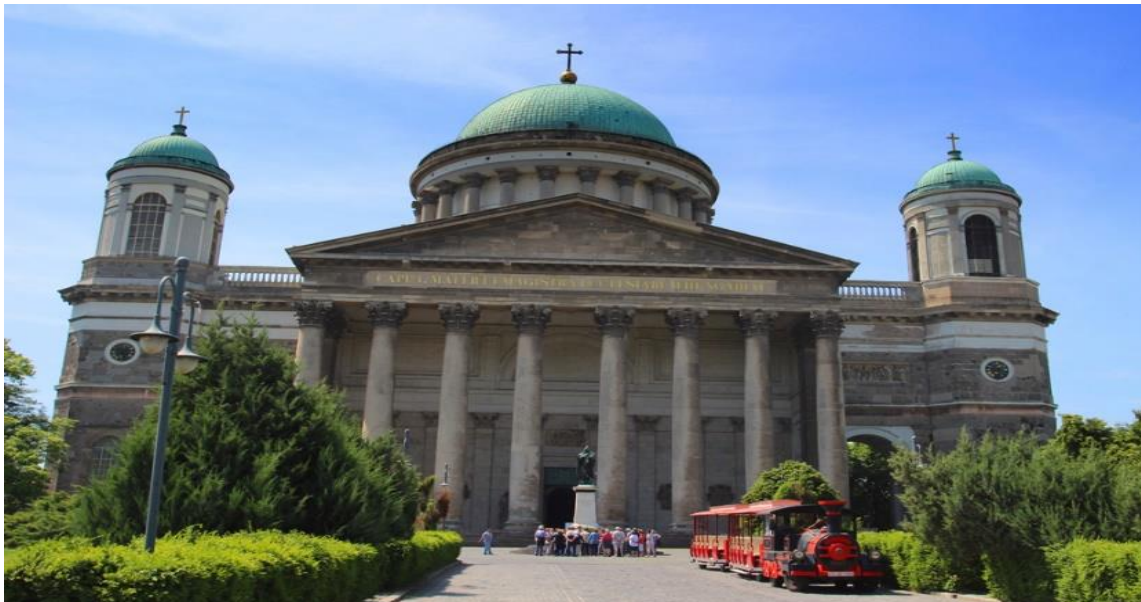
The group visited the Cathedral of Ostrihom (Esztergom) – Hungary’s largest church and tallest building. This massive church offers spectacular views of the Danube River.