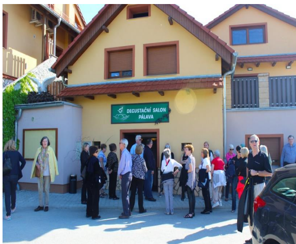
Wine-tasting at the neighboring town of Valtice, the center of winemaking in Czech Republic