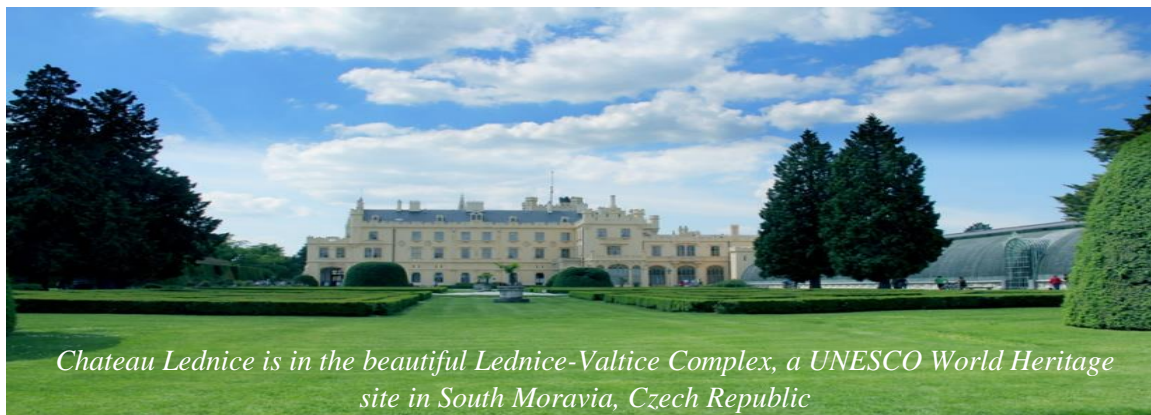
Chateau Lednice is in the beautiful Lednice-Valtice Complex, a UNESCO World Heritage site in South Moravia, Czech Republic