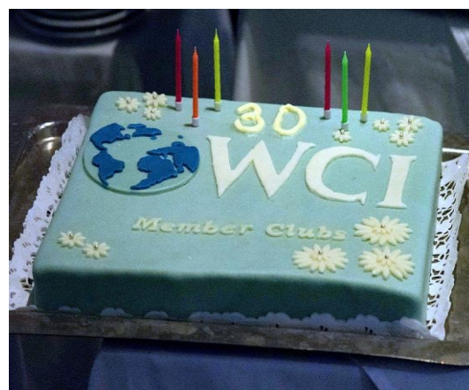
Happy 30 th Anniversary WCI!