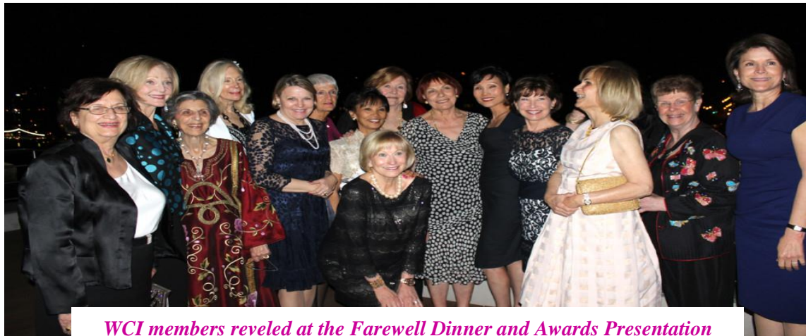
WCI members reveled at the Farewell Dinner and Awards Presentation