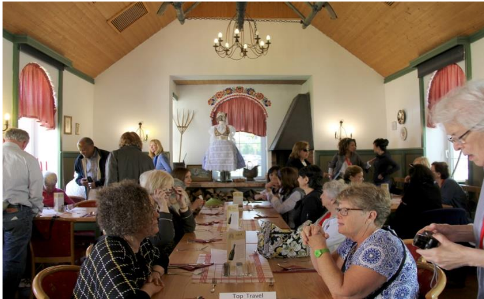
Enjoying Slovakian cuisine and entertainment in Bratislava, Slovakia