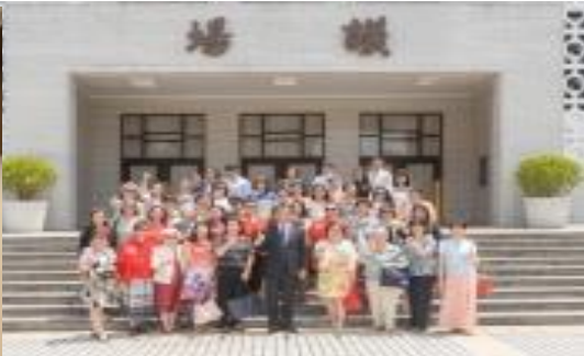
WTIC International Cooking Demonstration, Hola Mexico!