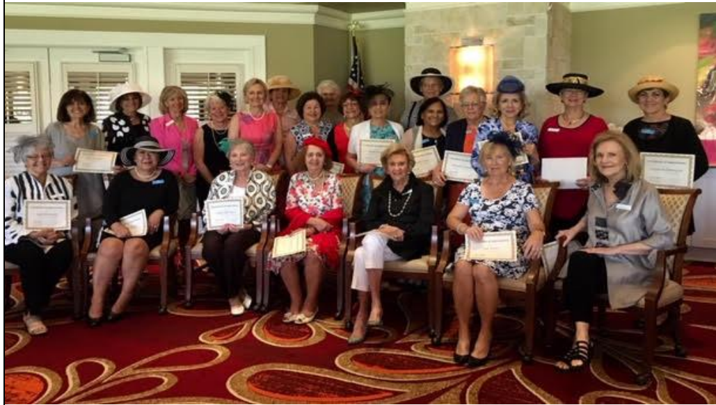
WFLIC Interest Group Chairs