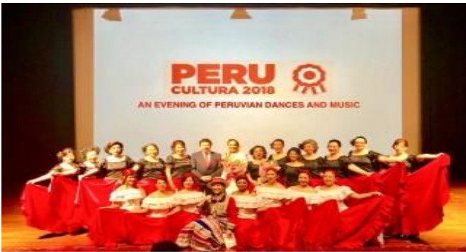
Ladies of WIC join the Peru Embassy for a lively Peruvian folkdance which was performed as well at WIC's birthday.