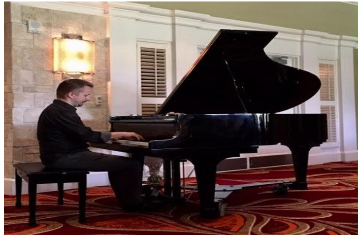
Internationally renowned concert pianist Ilya Yakushev