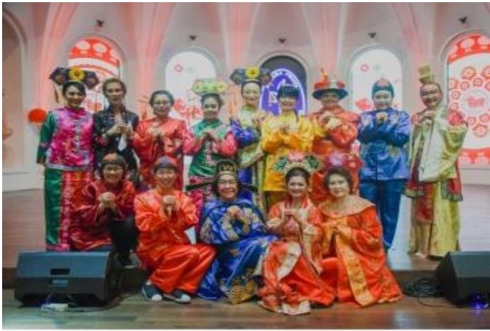
WIC Ladies performing the Chinese Drama "Sampek Engtay" to celebrate Chinese New Year