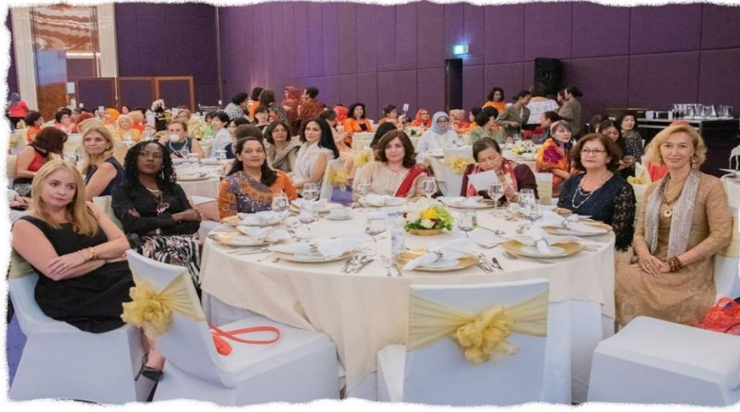
Our Ambassador Ladies at WIC's Birthday Party