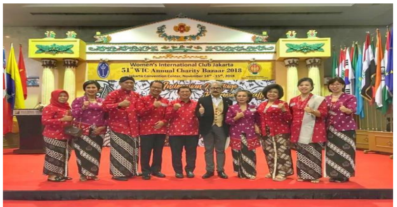
A big "Thank You!" to our Sponsor delegation from Yogyakarta