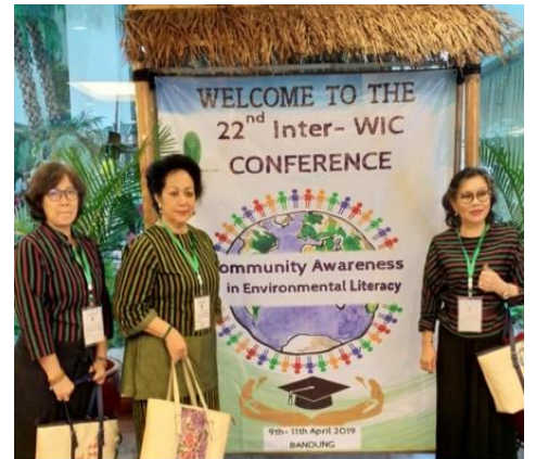
WIC Jakarta at the 22nd Inter WIC Conference in Bandung - April 2019