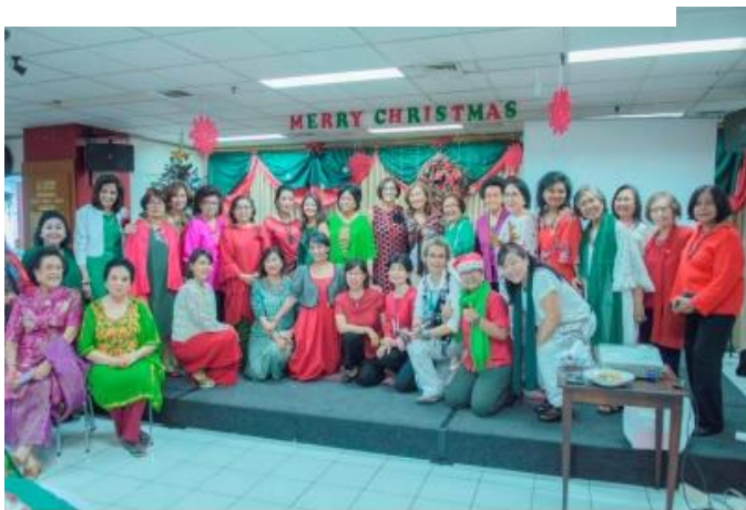
Merry Christmas at WIC