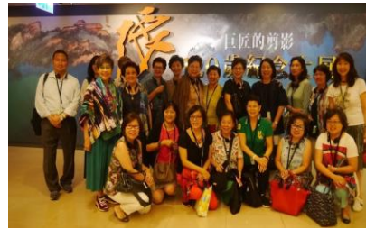
A Retrospective of Chang Dai-Chien's Art