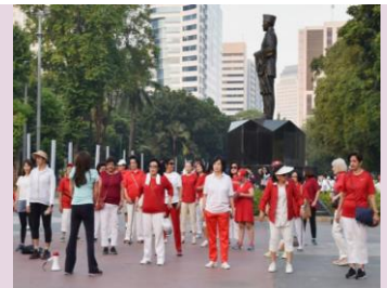
Fun walk at the Gelora Bung Karno stadium in October