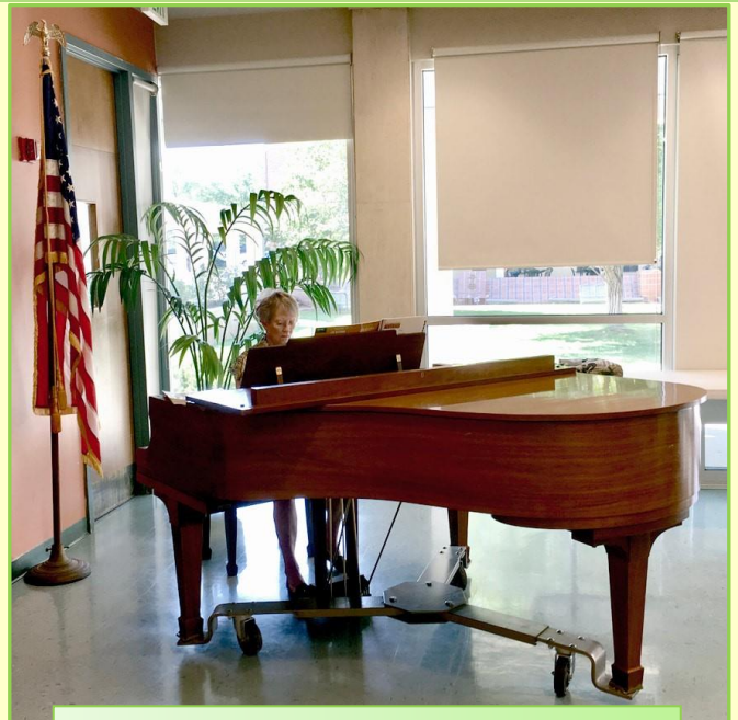
Guest pianist at the Fall Coffee event