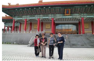
National Theatre & Concert Hall