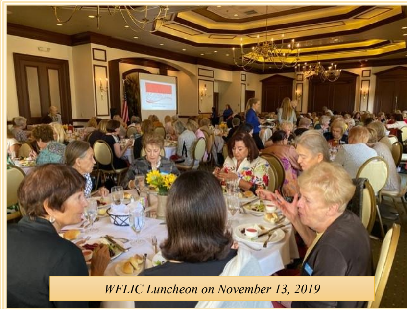
WFLIC Luncheon on November 13, 2019

Many members arrived early for the first luncheon of the season, as this is a new opportunity to sign up for participation in one or more of the 21 different interest groups offered by WFLIC. Our members are eager to partake in the diverse educational and social activities and special events offered by our Club. We are off to another strong start of the season here in southwest Florida.