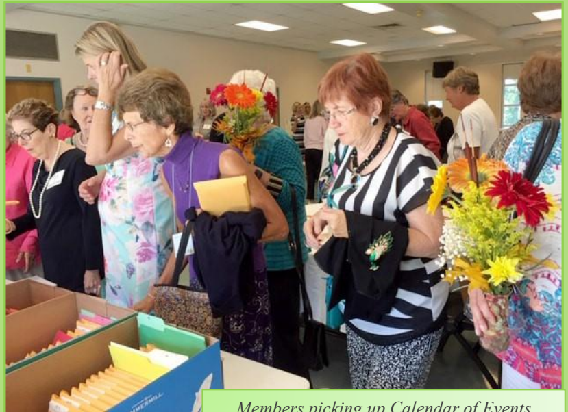
Members picking up Calendar of Events