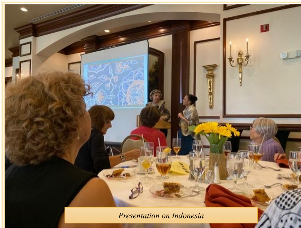
Presentation on Indonesia