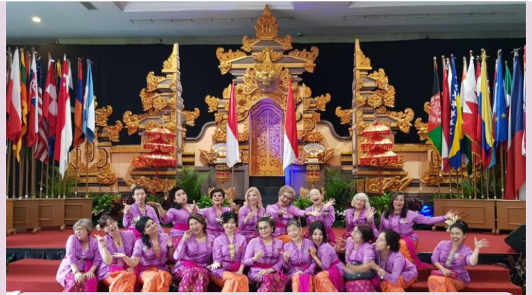
The WIC Jakarta Executive Committee at the 2019 Charity Bazaar