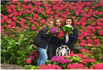
Hydrangea Flower Field