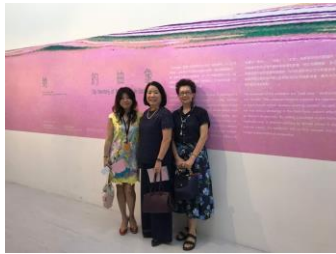
The Her-story of Abstraction in East Asia