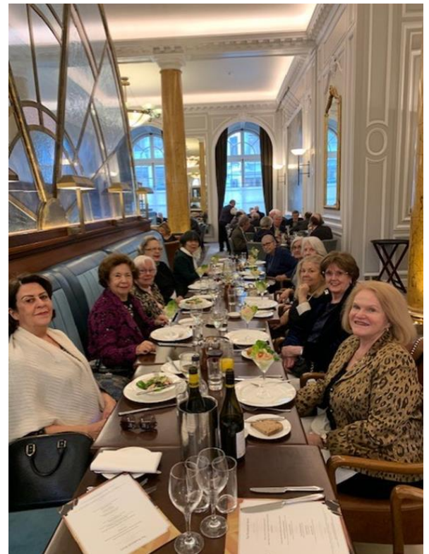
At WTL's Christmas Luncheon