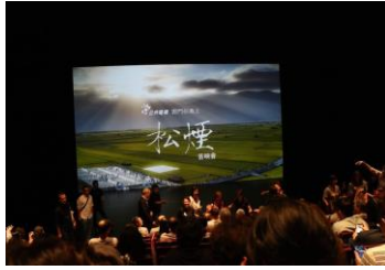
Experience at Cloud Gate Theatre