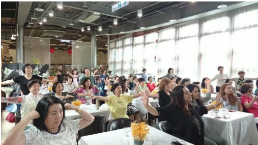
Body & Soul Lecture and Tea Party