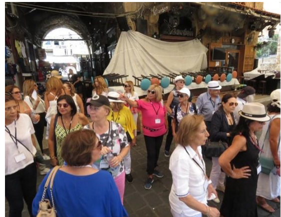
VIA (Vision of International Awareness) Lebanon International Club members at a brunch outing