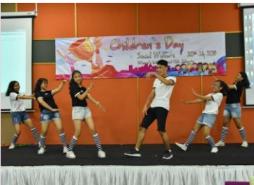
WIC Jakarta celebrating Children's Day with Social Welfare organizations it supports