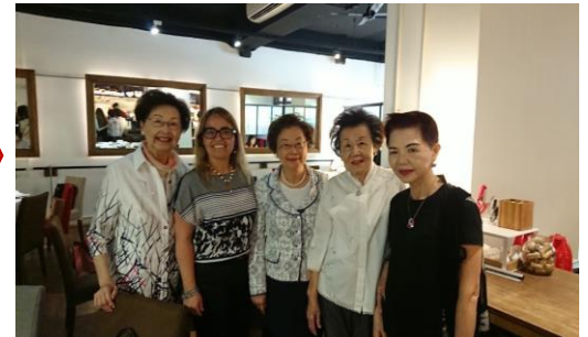
Cooking Demo at Chez Yeh