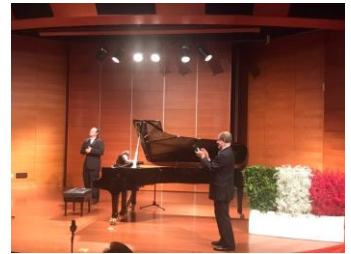
Mexico Music Night