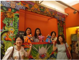
Taiyuan Asian Puppet Museum