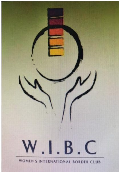
San Diego, California

Our logo stands for all women from all paths of life as embodied in the goals our club pursues. The black circle symbolizes strength and presence of all cultures. It is modulated to represent freedom and respect, and the interrelation of those values in all cultures. The rectangles and their color combinations stand for effective leadership, hope and happiness. The hands holding the circle generate tenderness and compassion with a firmness necessary to resolve the issues facing women today and tomorrow.