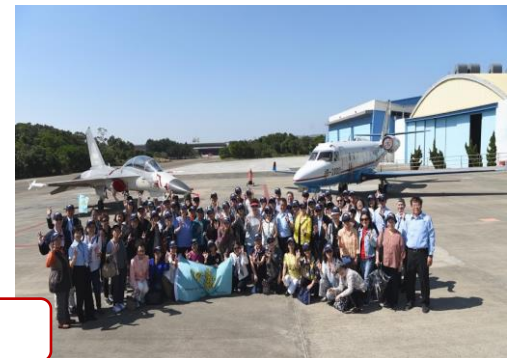
Autumn Excursion to AIDC & CCK Air