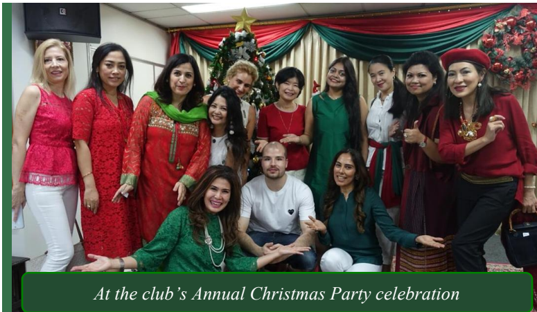
At the club's Annual Christmas Party celebration