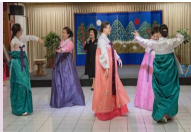
Korean Cultural Event