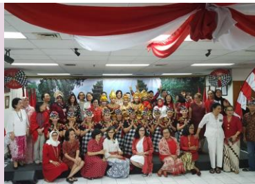
Celebrating Indonesia's Independence Day in August