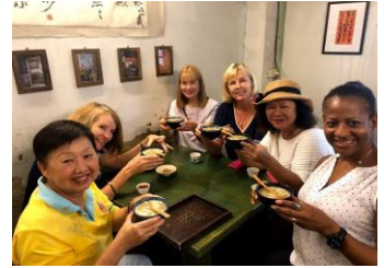
Historic Town - Beipu